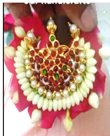
Ornament made from flower

ii) Training in Floriculture: Bandhan Society effectively improved floriculture and seed systems through DTCL and with the help of BRCP-1 project to improve the skills in the management of SBSS in quality floriculture and marketing. Associations also work on WE projects. She started working as Permanent Group Secretary in the Women's Economic Empowerment Project. Master Trainer in WE project in terms of work skills and functional roles. Serving as I am working on women's financial development, removal of discrimination between men and women, child marriage, dowry abuse of women, rearing of cattle, education, health, etc. at the field level among women.