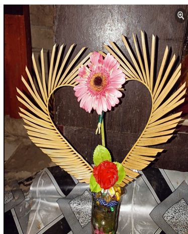
Show piece made from flower